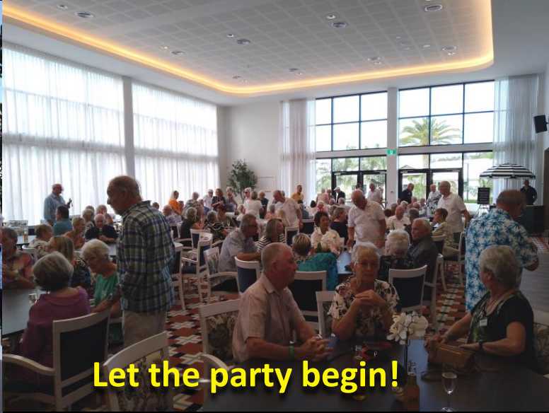
Let the party begin!